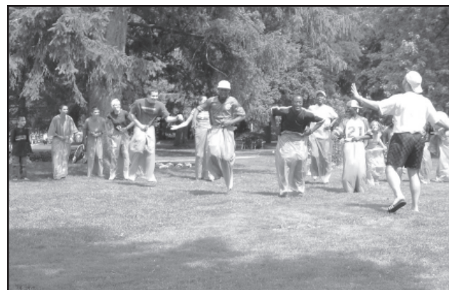
Kids enjoy themselves at The Journey's refugee picnic.

A member of The Journey said, "It was awesome to see people from around the world laughing, dancing and having a great time. It was humbling to listen to many of their painful stories of how they have arrived here in Canada, many fleeing