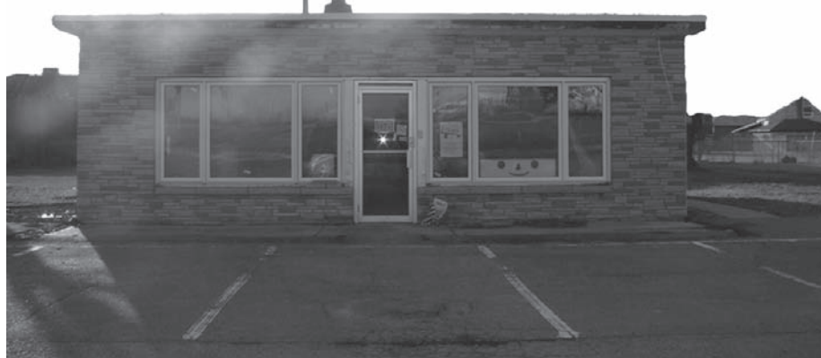
The Lockside Cove Café in St. Catharines, Ontario.

The church is discovering that when you step out faithfully into the community to serve, God is already there and ready to involve you in building a bigger, lovelier, even tastier, place to belong.